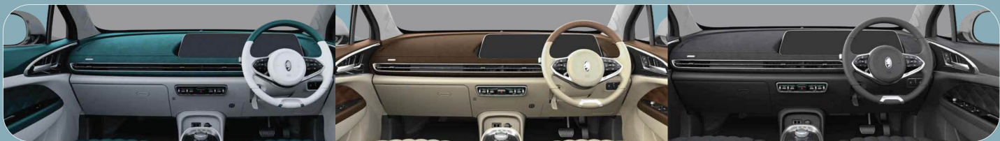
Two-Tone Interior: Green with Grey