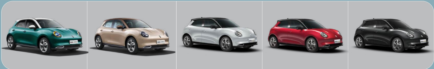
Verdant Green with White Roof